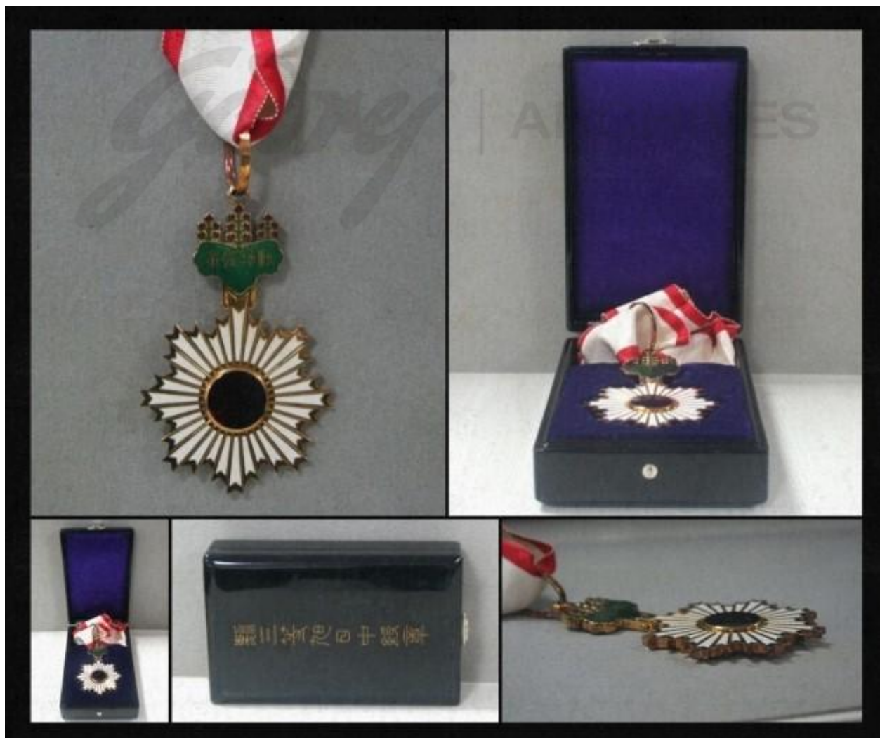
Medal of the 'Order of the Rising Sun, Gold Rays with Neck Ribbon'

This birth anniversary month, we take great pride in sharing with you some images of the award ceremony and the award itself.